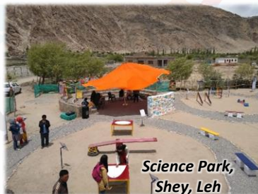
Science Park, Shey, Leh