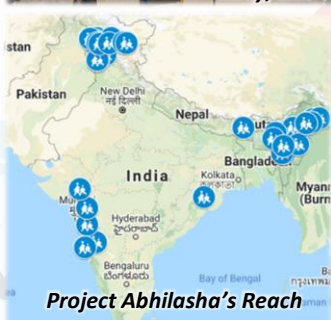
Project Abhilasha's Reach