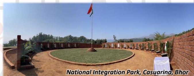
National Integration Park, Casuarina, Bor

To make our citizen aware about the real heroes of India, National Integration Park is built as a memorial to the Param Vir chakra awardees. An interactive card game featuring Param Vir chakra and Ashok Chakra recipients and Android apps in Marathi & English are conceptualized & designed. A monthly e-magazine sharing the brighter news from border regions is published. Maqbool Sherwani Library has the resources for a detailed scholarly research about the problems faced by the border area population.